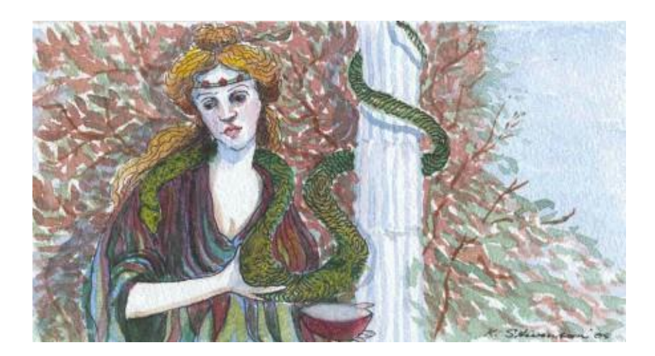
'Health, greatest of all the blessed gods, may I live with you for the rest of my life' Hymn to Hygieia, Ariphron

In the ancient Greek sanctuaries of healing statues of Hygieia, the goddess of health, reminded the pilgrim of the archetypal quest for wholeness and well being. Adorned with a simple garment Hygieia was often represented as youthful, radiant and smiling, attributes that are companions of health. Either she is holding or feeding a snake. Carrying a bowl of food or water Hygieia is generally represented tending the sacred snakes that were housed in the temples on the sanctuaries of healing. Sometimes she is presented holding a wreath of laurel, combining victory with health, or other plants known for their medicinal properties, a motif that links her to an ancient tradition of woman healers, herbalists and midwives.