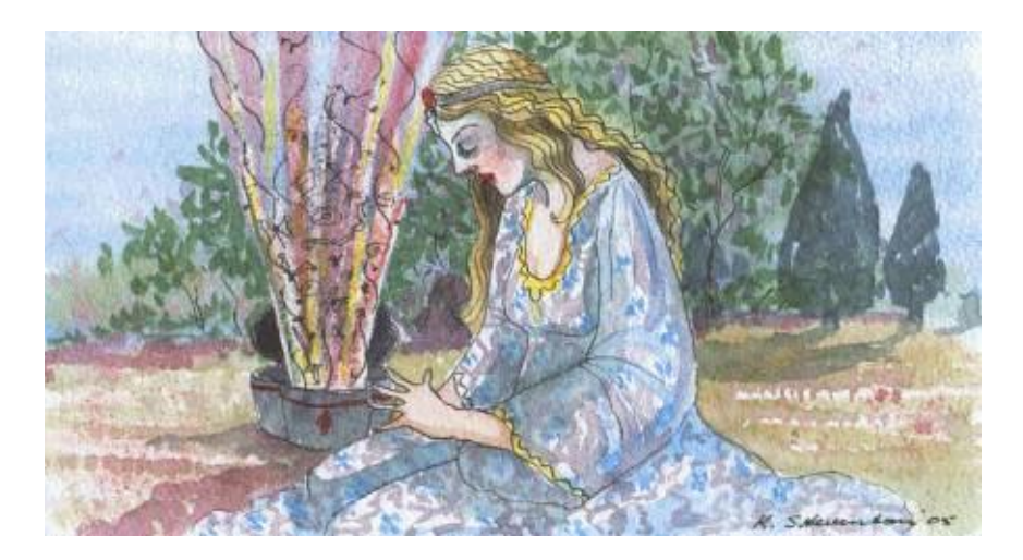
'Hope sole remain'd within, nor took her flight, Beneath the vessel's verge conceal'd from light' Hesiod

Pandora's story was written eight centuries before Christ in the epoch when gender roles were rigidly defined. Yet the mythic plot echoes timeless motifs, even ones used in contemporary science fiction. In Greek myth Pandora is the first woman, mother of all mortal women, created by the gods to assert their superiority over mankind. Cast as a femme fatale, a 'beautiful evil', she possesses a jar filled with toxins designed to pollute the race of mankind. Alluring, yet dangerous, Pandora represents a vestige of the ancient goddess culture threatening the emergent patriarch. Yet she also transports an indelible gift from the goddess embedded at the bottom of the urn.