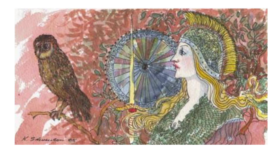
'I celebrate the powers of Pallas Athena, the protectress of the city: Dread, as Ares, She busies herself with the works of war, With the sack of cities, with the battle-cry and with the combats. It is She also who saves the fighters that go to war and come back alive. Hail, Goddess, give us good fortune and happiness Pallas.' Homeric Hymn 11

Pallas Athena - The Wisdom Of The Warrior